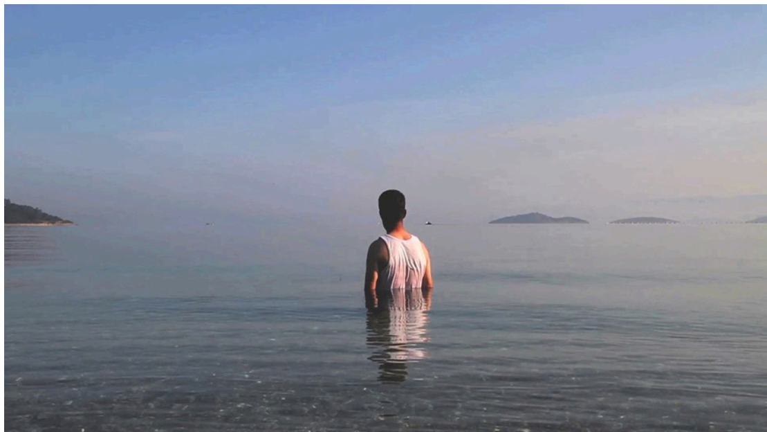
A Message to the Sea, 2012. (Still). Video.

I have just upgraded the equipment in my studio, which is already helping me smooth a lot of work pressure. I am spending time learning animation and sound design for an upcoming project. This absolute new direction was only possible because of the loan. I am able to expand my possibilities without having to face additional burden on me at once.