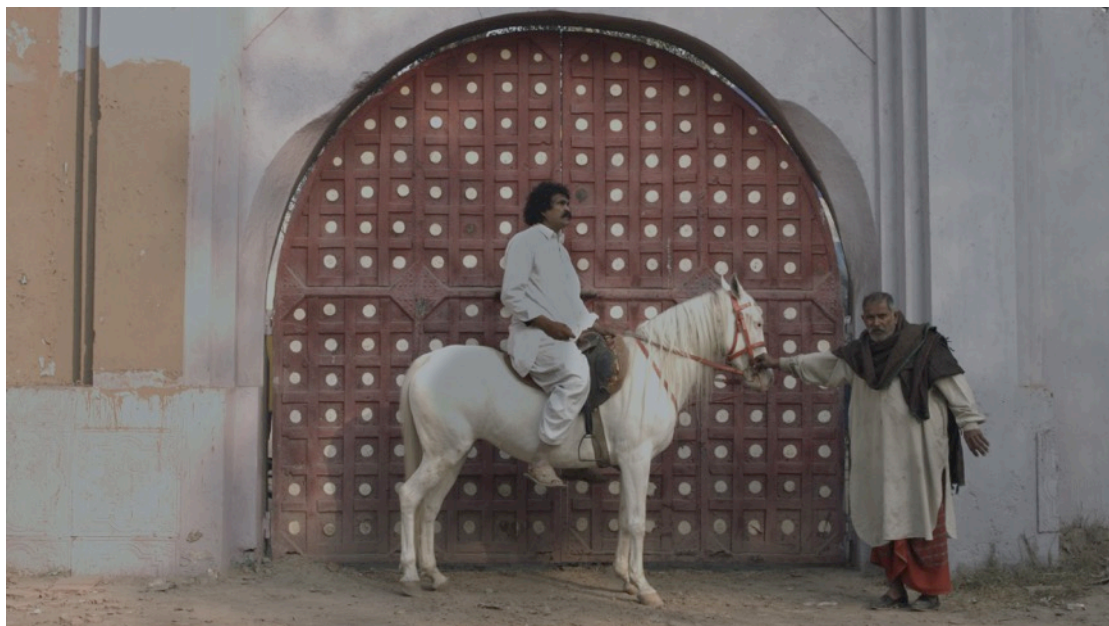
All voices are mine, 2018 (Still). Video commissioned by Sharjah Art Foundation.