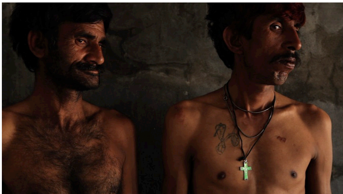
Power Between Weak, 2014. (Still). Video.

I do have an official website ( http://www.basirmahmood.com/ ) and an Instagram account ( https://www.instagram.com/basir_mahmood/ ) that I keep updated as I produce work.