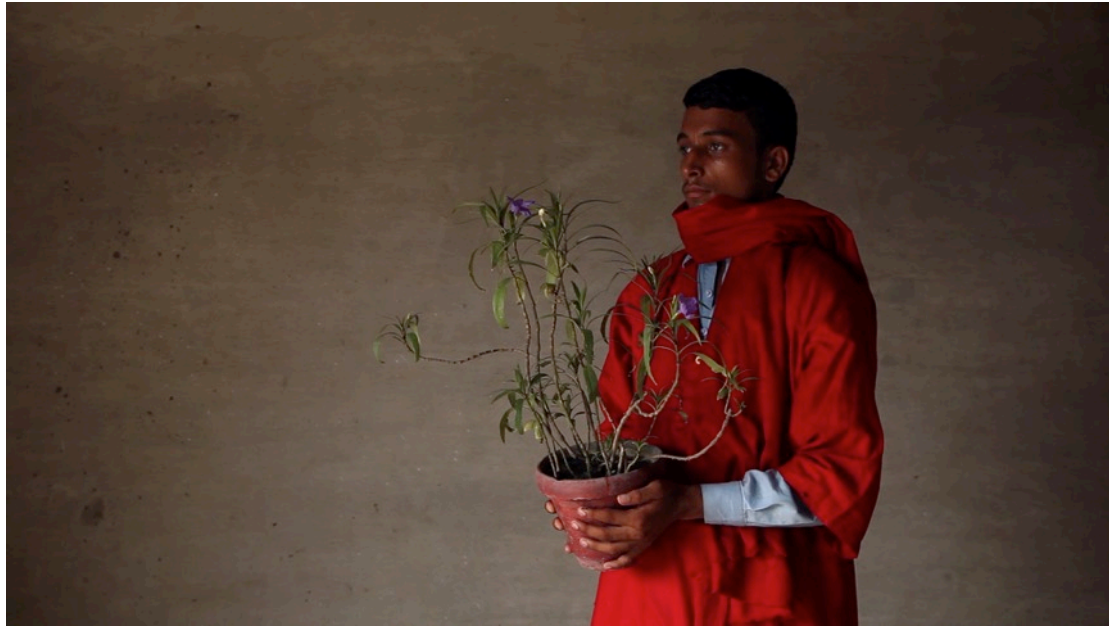
Monument of arrival and return, 2016. (Still). Video. Co-produced by Contour Biennale 8.